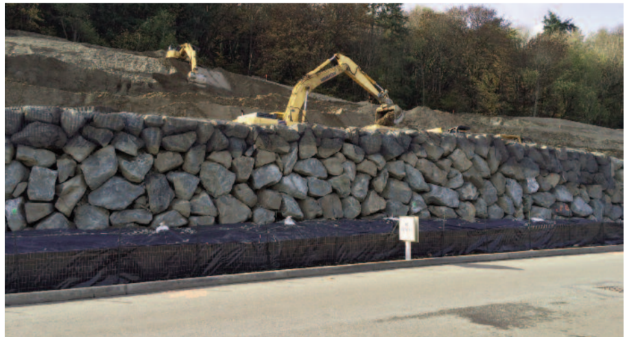
Figure 2. MSE Rockery Wall with Miragrid® soil reinforcement.