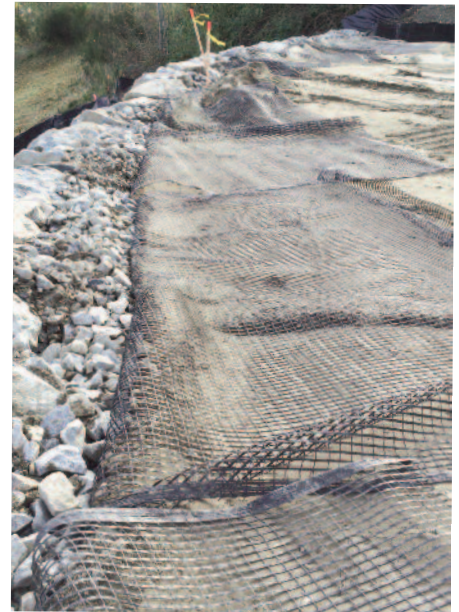
Figure 4: Miragrid® geogrid wrap at rockery face without separation fabric.

Using Miragrid® geogrid soil reinforcement solutions, a multitiered MSE structure was completed. The structure consists of rockery faced Miragrid® geogrid wrapped MSE walls separated with a Miragrid® geogrid reinforced steepened slope. The complete MSE structure offers a private access drive on a steep hillside to custom homes built with a commanding view of Mt Rainer in the distance.