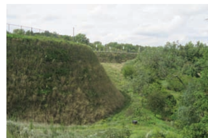
Southeast side of VRSS-2.