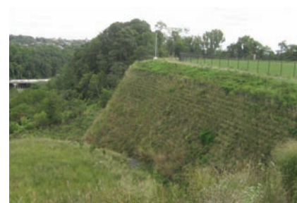
Northwest side of VRSS-2.

The vegetation specified for the bioengineered face of the project included: Aronia arbutifolia , Clethra alnifolia , Comptonia peregrina , Cornus racemosa , Hypericum calycinum , Panicum virgatum , Rhus aromatic , and Viburnum acerfolium .