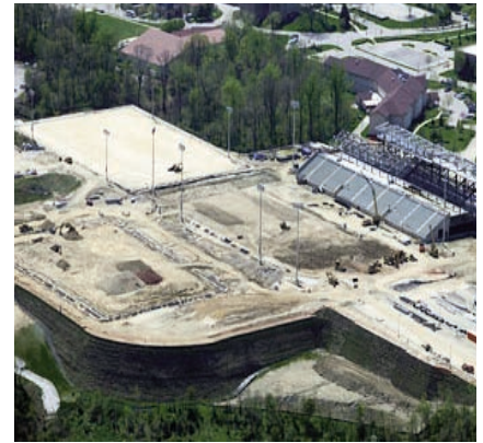
Aerial view of complex. VRSS-2 on the left connecting to VRSS-3.