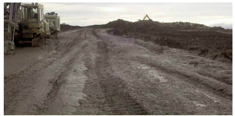
Clay/silt conditions after an early spring snow fall.