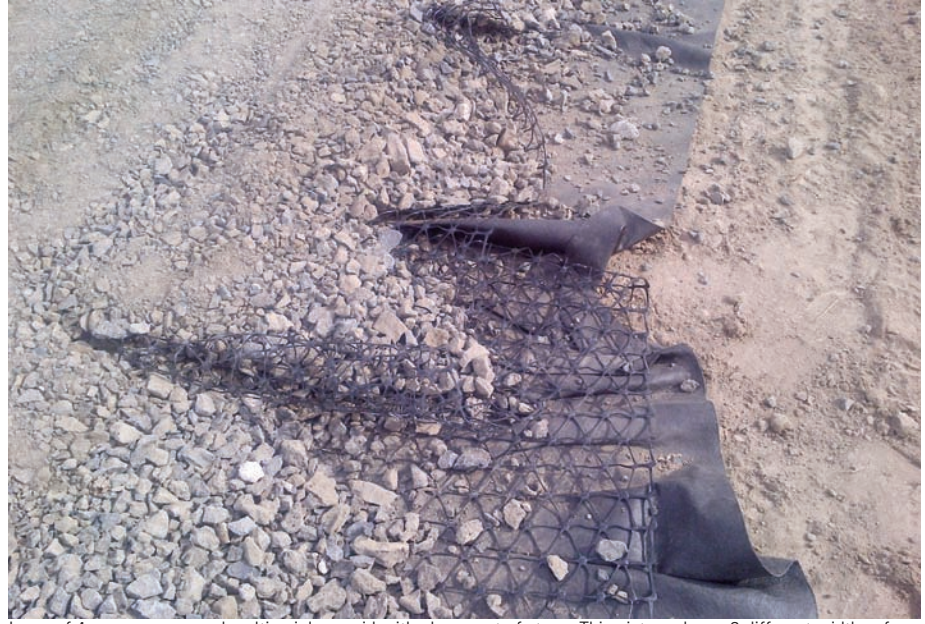
Layer of 4 oz nonwoven and multi-axial geogrid with placement of stone. This picture shows 2 different widths of material with kinks and folds in the material. There is not full geosynthetic coverage over the subgrade surface.

TenCate® Geosynthetics Americas assumes no liability for the accuracy or completeness of this information or for the ultimate use by the purchaser. TenCate® Geosynthetics Americas disclaims any and all express, implied, or statutory standards, warranties or guarantees, including without limitation any implied warranty as to merchantability or fitness for a particular purpose or arising from a course of dealing or usage of trade as to any equipment, materials, or information furnished herewith. This document should not be construed as engineering advice.