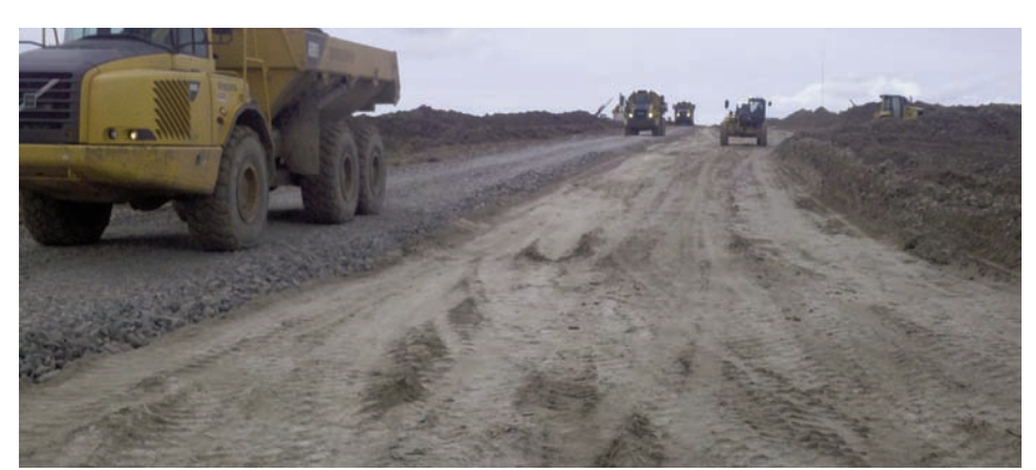
Haul road constructed with Mirafi® HP570 as designed.