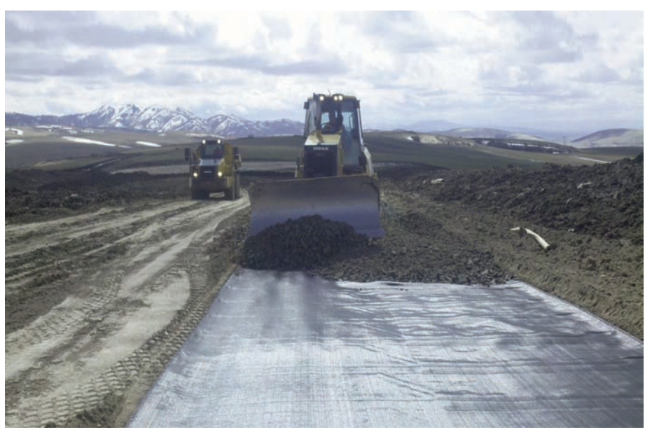
Placement of Mirafi® HP570 and 10" to 12" of 3" minus hasalt stone

Burks Excavation LLC is currently building 18 miles of new access roads in some of the worst conditions. They are working with soils known as collapsible silts with a CBR rating of 1 or less. As the clearing and grubbing of road sections began, they quickly realized that there would be very little chance of bridging over the poor soils, and after losing 3 to 4 feet of rock in a small test section, it was decided to try Mirafi® HP570 geotextile. The results were amazing. Mirafi® HP570 was placed as recommended and the road construction began. Once the installation began, they we were able to cover 2650 linear feet in just one day. TenCate Mirafi® HP570 is highly recommended when building roads in areas with poor sub-grade material. Due to the soil conditions, weather and the construction schedule, Mirafi® HP570 allowed construction to start early and continue through the elements.