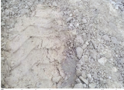
Test section using a 4 oz nonwoven geotextile and a multiaxialgeogrid with 3' minus basalt stone. Picture shows the 3" stone ruptured the multi-axial grid after the first few passes.