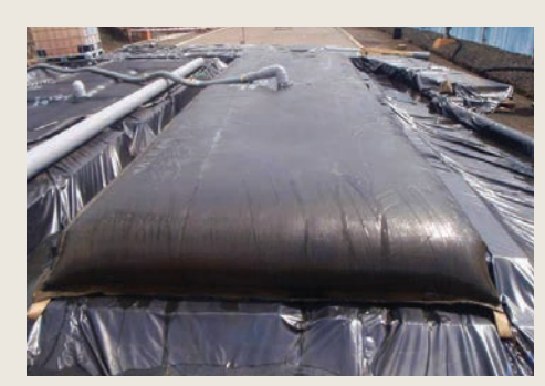
Dewatering of oil sludge

Through continuous or event driven pond maintenance dewatering programs to insure sufficient capacity, TenCate Geotube<sup>®</sup> dewatering and containment technology provides a simple, low cost solution. Easy to set up, even in remote locations, TenCate Geotube<sup>®</sup> dewatering technology can quickly be deployed to reduce lagoon levels or be used to contain the full volume of dewatered waste material for a complete cleanout.