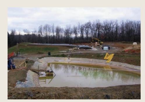
AMD sediment pond

The treatment process of an AMD waste with TenCate Geotube<sup>®</sup> dewatering technology is accomplished through the containment and dewatering of the precipitated solids. The dewatered solids can then be safely and economically disposed in an approved landfill site thus eliminating an environmental problem.