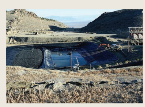
Barren and pregnant ponds

By capturing and containing valuable metals using TenCate Geotube<sup>®</sup> containers, the expense of treating mine waste can be offset and become a valuable income stream.