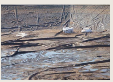
Pond empty for HDPE liner repair