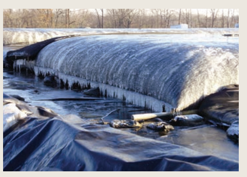
Dewatering under winter conditions