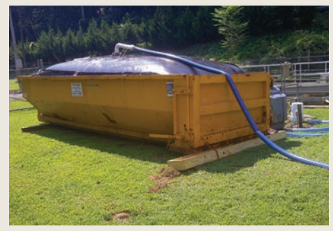
Geotube® Mobile Dewatering System

TenCate Geotube<sup>®</sup> dewatering and containment technology is a simple, low tech solution ideal for remote or highly industrialized locations. TenCate Geotube<sup>®</sup> containers can be customized in size and shape to meet almost any need. Whether an individual Geotube<sup>®</sup> unit is required to fit into an underground gallery, or multiple, large tubes need to be stacked above ground to accommodate large volumes within a specific footprint; whatever the situation, TenCate can customize a dewatering solution right for you