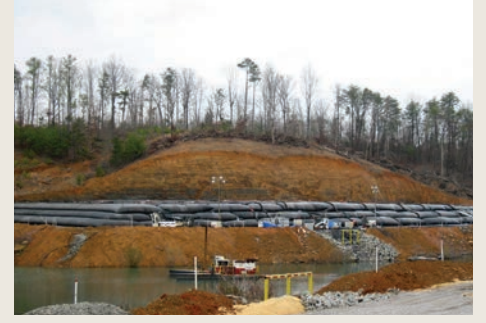
Dewatering of waste slurry

Whether it be a natural disaster, a catastrophic event affecting tailing ponds, permit restrictions, interruptions of mechanical dewatering processes, above or underground capacity limitations, or sudden increase in slurry production that strains the existing dewatering facility, TenCate Geotube<sup>®</sup> containers, in a variety of sizes to fit almost all situations, are readily available to restore tailings operations.