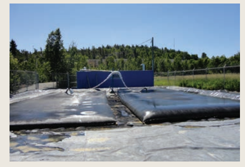
Closed loop process for drilling water management

The specially engineered TenCate Geotube<sup>®</sup> textile retains the solids while releasing the clear water through the pores of the fabric. The effluent is typically of a quality that can be reused for mine processing operations, making this an economical and sustainable technology for mine water management.