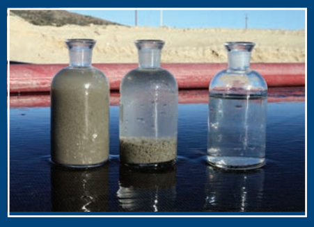
Sludge before (left) and after (right) treatment with Geotube® dewatering technology.

TenCate Geotube<sup>®</sup> containers can be custom-sized to fit available space and be easily removed when dewatering is complete. Dewatered solids can be safely stored on site, re-utilized to build dykes and berms, or disposed of in a landfill without expensive dredging or transportation.