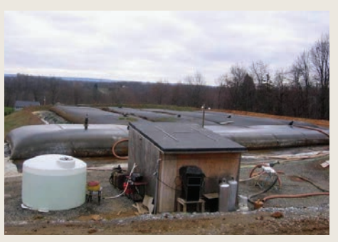
Geotube® dewatering cell