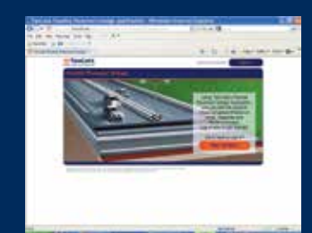
MiraSpec Design Solutions Software is easy to use and is available at no cost at www.Mirafi.com