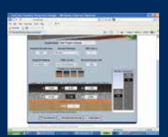
MiraSpec Design Solutions Software provides cost savings and "green" savings by incorporating a geosynthetic.

As the leader in geosynthetic solutions, TenCate