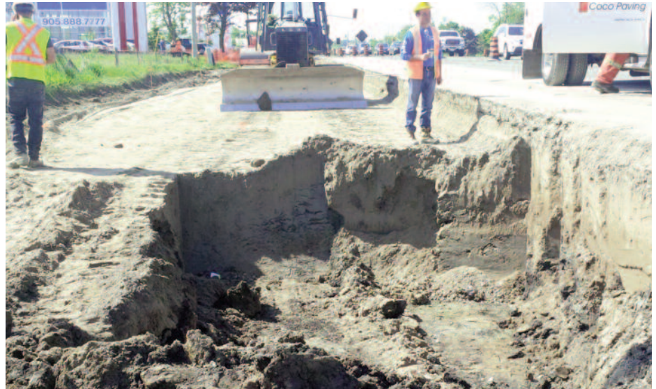
Excavation of the southbound lane of Highway 48.

To attain this level of performance, an additional placement of 575mm of granular sub-base would have been required.