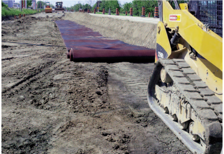
Placement of Mirafi® RS580i.