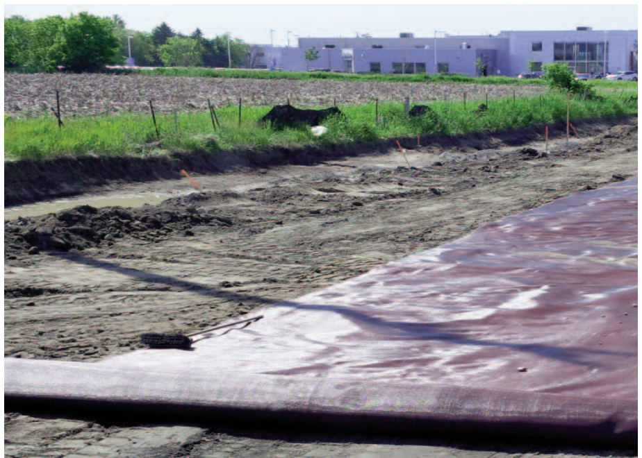
Placement of Mirafi® RS580i.

TenCate Geosynthetics Americas assumes no liability for the accuracy or completeness of this information or for the ultimate use by the purchaser. TenCate Geosynthetics Americas disclaims any and all express, implied, or statutory standards, warranties or guarantees, including without limitation any implied warranty as to merchantability or fitness for a particular purpose or arising from a course of dealing or usage of trade as to any equipment, materials, or information furnished herewith. This document should not be construed as engineering advice.