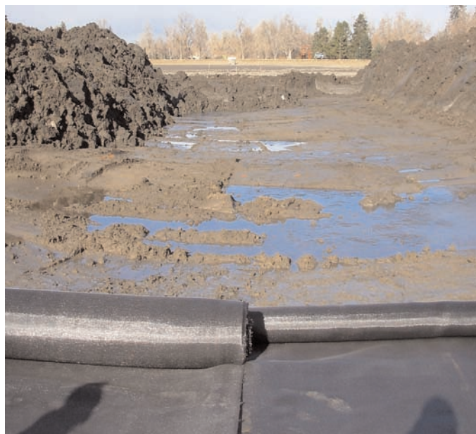
Mirafi® HP570 being installed in a very soft pond bottom.