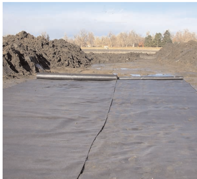
Mirafi® HP570 installed with appropriate overlap.