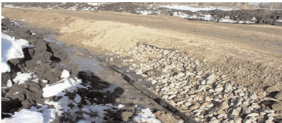
Completed section utilized as a haul road.

TenCate™ Geosynthetics North America assumes no liability for the accuracy or completeness of this information or for the ultimate use by the purchaser. TenCate™ Geosynthetics North America disclaims any and all express, implied, or statutory standards, warranties or guarantees, including without limitation any implied warranty as to merchantability or fitness for a particular purpose or arising from a course of dealing or usage of trade as to any equipment, materials, or information furnished herewith. This document should not be construed as engineering advice.