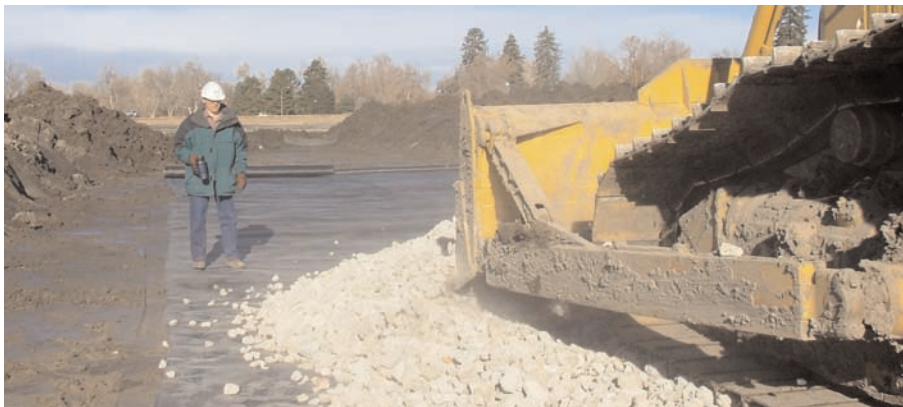
Track equipment is used to place the rock onto the geotextile.

Once the first few hundred feet of the geotextile reinforced haul road was built, the contractor successfully tested it with some of his heavier equipment. They proceeded to finish all of the haul roads with the geotextile reinforced design. The Mirafi® HP geotextiles not only saved material costs, they saved the contractor valuable time that would have otherwise been spent waiting for the pond to dry and strengthen, or both time and material on continuing to excavate and bringing in more rock. Once the geotextile reinforced haul road was built, the contractor had to do very minimal maintenance on the haul road. The contractor's loaded and unloaded belly dumps made about 26,000 passes in the sixty days it took them to complete the job. The geotextile reinforced haul road allowed him to complete this job on schedule, with minimal maintenance, and without fear of losing more equipment into the pond muck.