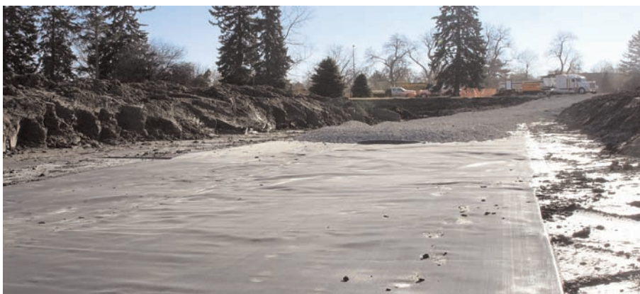
The rock material is being worked out over the Mirafi® HP570 geotextile.