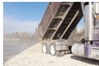
An end-dump is used to place the rock onto the geotextile.

confinement for the haul road. The Mirafi® HP270, with its superior water flow (50 gal/min/ft 2 ) and high strength and (2,640 lb/ft) and durability was used to separate and reinforce between the aggregate layers. It also allowed the contractor to use less expensive crushed rock base for the top one and a half feet, thereby saving material costs for the rock.