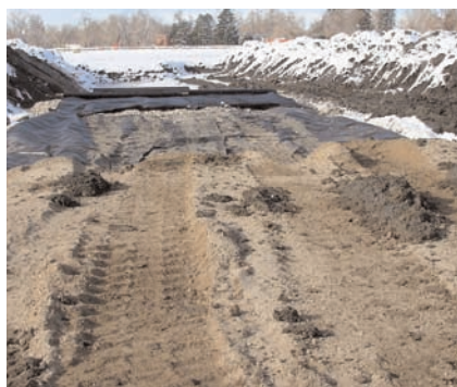
The Mirafi® HP270 was then placed on top of the rock material before the base course is brought up.