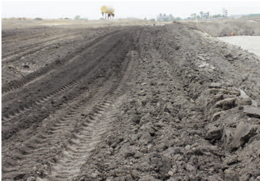
Native alluvial & organic soils covered a large area of the project site

In the areas of the former detention basins, very moist to wet soils were anticipated to be encountered at the base of the recommended over-excavation. SCG provided preliminary recommendations in the soils report for subgrade stabilization. SCG recommended stabilization through placement of a highly permeable, high modulus geotextile fabric (TenCate Mirafi® RS380i*) and a minimum 18-inch thick layer of crushed stone (2 to 4 inch particle size).