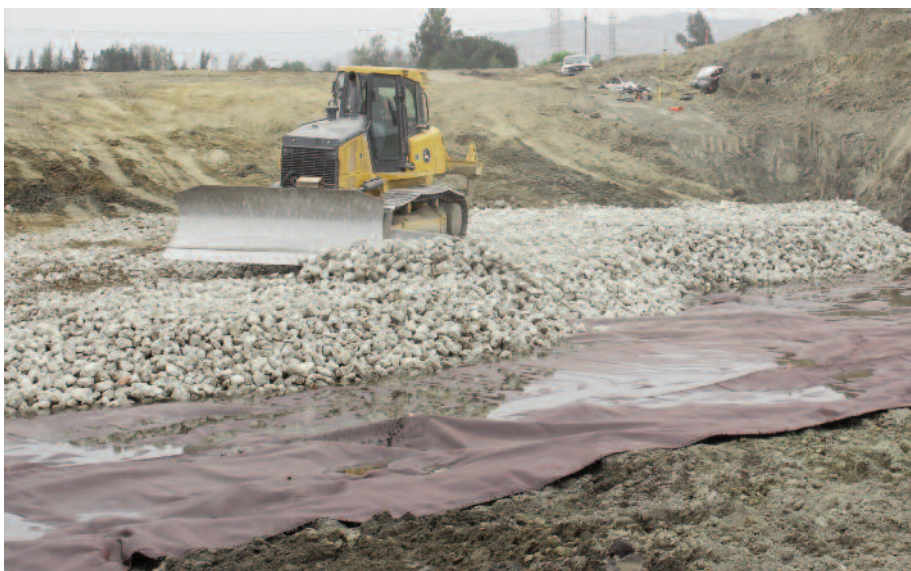
Track Mounted Dozer spreads the crushed concrete over Mirafi® RS380i.

TenCate® Geosynthetics Americas assumes no liability for the accuracy or completeness of this information or for the ultimate use by the purchaser. TenCate® Geosynthetics Americas disclaims any and all express, implied, or statutory standards, warranties or guarantees, including without limitation any implied warranty as to merchantability or fitness for a particular purpose or arising from a course of dealing or usage of trade as to any equipment, materials, or information furnished herewith. This document should not be construed as engineering advice.