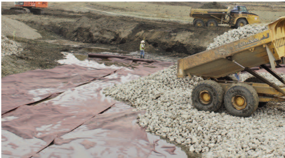
Dump Truck dumps the large/angular crushed concrete onto Mirafi® RS380i.

The result is a completed firm stabilized platform for construction of the 4 commercial buildings & surrounding parking lots & loading docks.