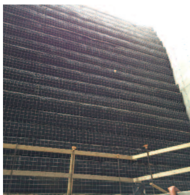
Full height Mirafi® Permanent Wirewall System adjacent to concrete structural wall.