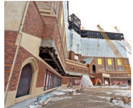
Sanford Medical Center Fargo, ND after the wall system was backfilled.

and support the facing material during construction. The Sanford Medical center temporary wall used Miragrid® 7XT for the primary reinforcement and Miramesh® TR for the facing option. The Miramesh® TR is designed for temporary applications and is manufactured in a dimension that saves labor and is flexible, making it easy to manipulate during construction. The design called for reinforcement at every 1.5' compacted soil layer with varying lengths to support different surcharge loads. One benefit of this wall system is the ability to easily vary slope angles and geometry. The temporary MSE structure needed to change inclinations to accommodate crane and man/material lift loads at certain locations where the wall needed to be vertical and also align to inside and outside angles proximate to the building. The wall is 2,000 ft. long, 14 ft. high and was in service less than a year. The steel forms were the same dimensions for both projects (W4 wire on 4"x4" spacing). The temporary wall wire forms did not need to be coated but the permanent wall forms required galvanizing.