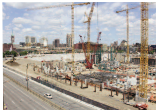
Viking Stadium site, Minneapolis, MN.

Both structures performed and are performing as designed. In both instances, the TenCate Wall Systems saved time and money by reducing construction costs in labor and material as well as meeting project schedules.