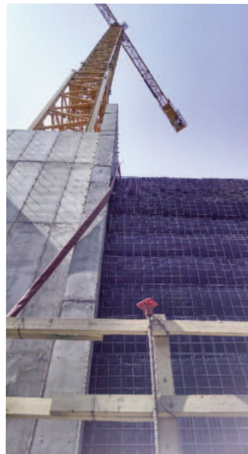
Mirafi® Permanent Wirewall System adjoining large crane pier.

TenCate Geosynthetics Americas assumes no liability for the accuracy or completeness of this information or for the ultimate use by the purchaser. TenCate Geosynthetics Americas disclaims any and all express, implied, or statutory standards, warranties or guarantees, including without limitation any implied warranty as to merchantability or fitness for a particular purpose or arising from a course of dealing or usage of trade as to any equipment, materials, or information furnished herewith. This document should not be construed as engineering advice.