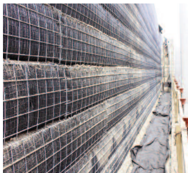
Completed below grade Mirafi® Permanent Wirewall System providing void between the building wall.