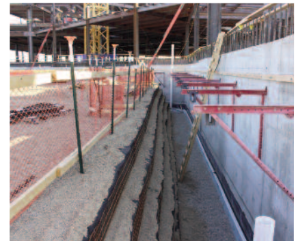
Mirafi® Wirewall System.