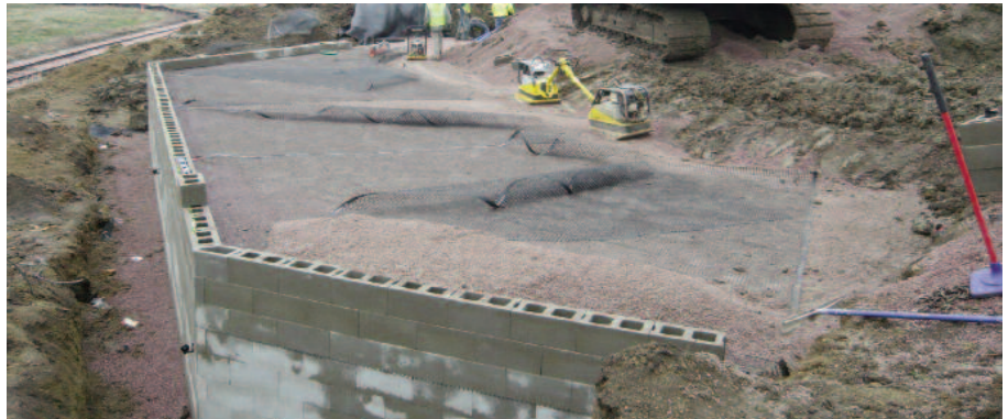
Mirafi® 7XT being installed to reinforce the south abutment.