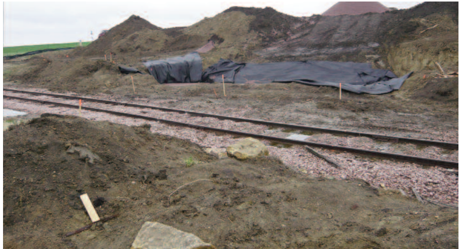
The north abutment site with reinforced soil foundation preparation.

To meet the limited budget for building the abutments, the Federal Highway Administration (FHWA) Geosynthetic Reinforced Soil Integrated Bridge System (GRS-IBS) was chosen. This system is the core of FHWA's initiative for innovative bridge construction for this type of abutment. It is derived from examples of ancient structures that utilize closely spaced organic materials to reinforce soil. The principles are the same for this modern design adaptation by using angular, crushed gravel with high strength geotextile or geogrid in frequent layers. The interaction of these components stabilize the structure internally. TenCate Miragrid® 7XT geogrids and Mirafi® HP570 geotextiles were chosen for this project. Although there are now over 100 GRS-IBS bridges in service throughout the country, the Rock County GRS-IBS bridge #67564 is the first in the state of Minnesota. It is also one of the tallest to date at 24 feet. The construction technique did not require deep foundation design and thus can be completed much less time, usually weeks. It also utilizes basic earthwork methods and practice with minimal environmental impact.