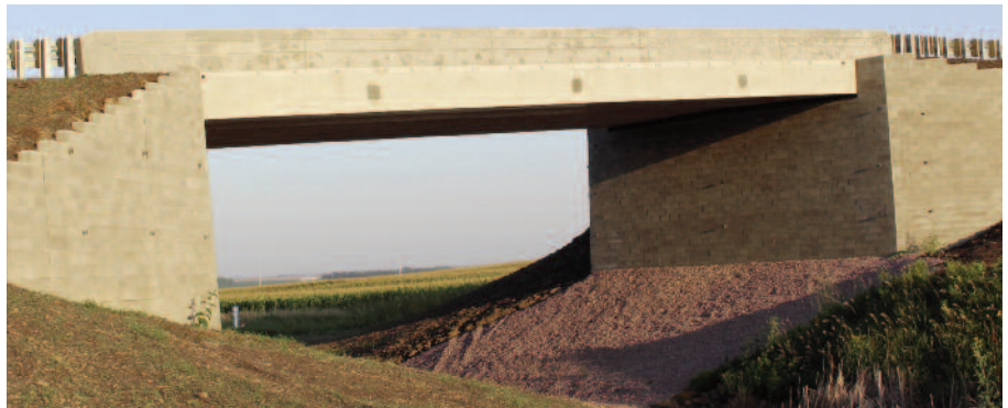
The finished GRS-IBS.

TenCate Geosynthetics Americas assumes no liability for the accuracy or completeness of this information or for the ultimate use by the purchaser. TenCate Geosynthetics Americas disclaims any and all express, implied, or statutory standards, warranties or guarantees, including without limitation any implied warranty as to merchantability or fitness for a particular purpose or arising from a course of dealing or usage of trade as to any equipment, materials, or information furnished herewith. This document should not be construed as engineering advice.