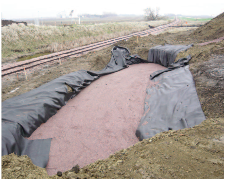
Mirafi® HP570 being used to construct the reinforced soil foundation.