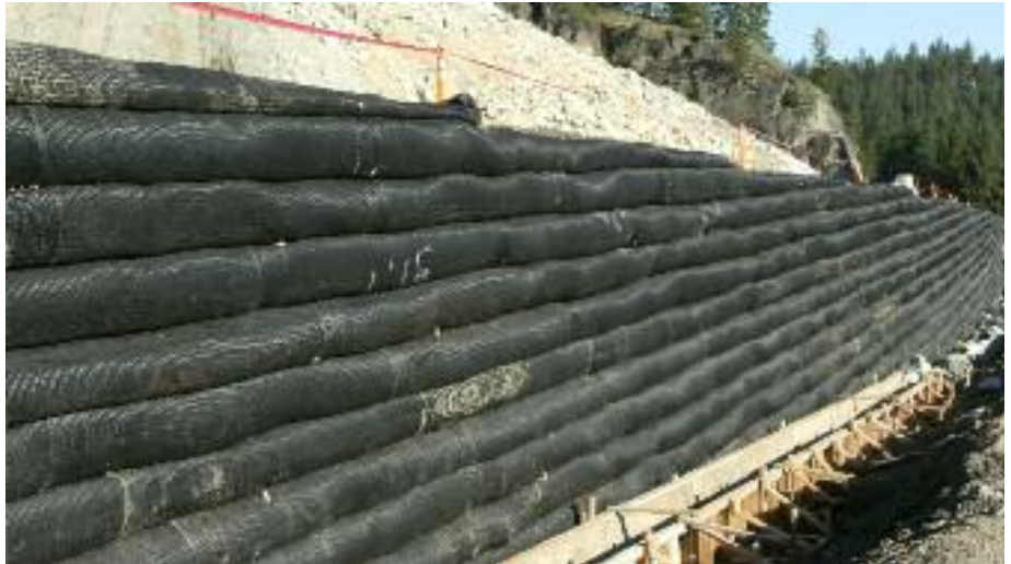
Lower wall section completed prior to placement of concrete panels.

The end result is a very cost-effective, very large and durable retaining wall with a sculpted pre-cast concrete face. Construction of the project is due to be completed sometime in 2011.