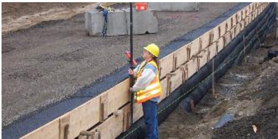
Wood forms being used to achieve compaction at the face of the wall.