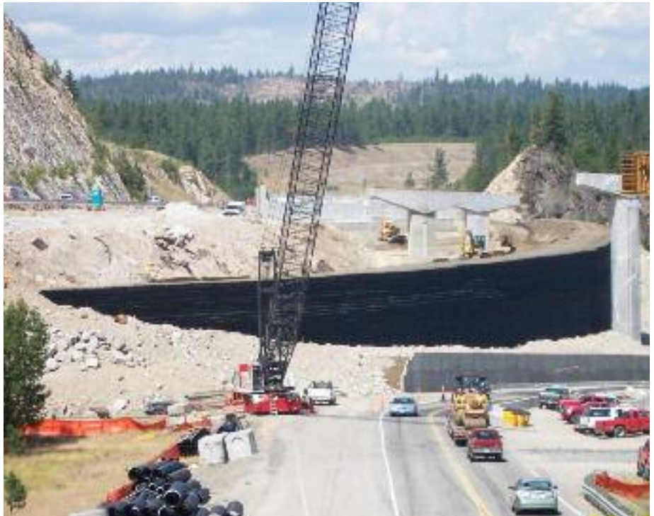
Completed wrapped face wall prior to placement of concrete panels.

TenCate™ Geosynthetics North America assumes no liability for the accuracy or completeness of this information or for the ultimate use by the purchaser. TenCate™ Geosynthetics North America disclaims any and all express, implied, or statutory standards, warranties or guarantees, including without limitation any implied warranty as to merchantability or fitness for a particular purpose or arising from a course of dealing or usage of trade as to any equipment, materials, or information furnished herewith. This document should not be construed as engineering advice.