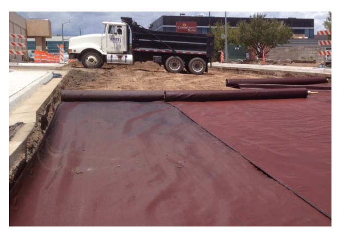
Image 7–Extending the Geosynthetic Reinforcement up a Vertical Face

When placing roadway reinforcement geosynthetics in trenches or against excavations that terminate at existing curb and gutter, the geosynthetic can be wrapped up the sides of the excavation as shown in Image 7. Doing so provides extra embedment for the geosynthetic to resist pullout and sliding forces by sandwiching the material between the vertical faces of the existing materials and the newly compacted fill.