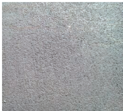
Micro seal and fabric after first winter.