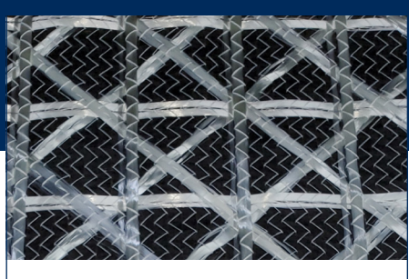
Mirafi® MPG<sup>4</sup> Composite Paving Grid

Mirafi<sup>®</sup> MPG<sup>4</sup> is specifically designed to be used in hot mix asphalt overlays over existing, distressed asphalt or jointed concrete pavements, or in new construction applications.