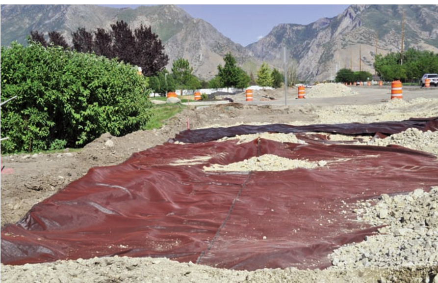
Initial area where Mirafi® RS580i was tested.