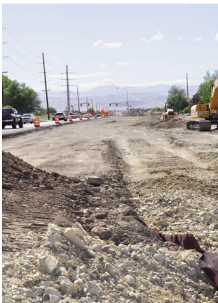
Preparation of subgrade.

The installation consisted of spot stabilization as well as large section stabilization.