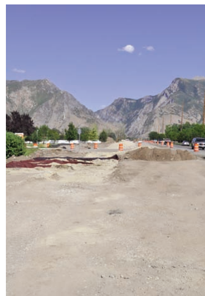
Preparation of subgrade and start of Mirafi® RS580i placement.