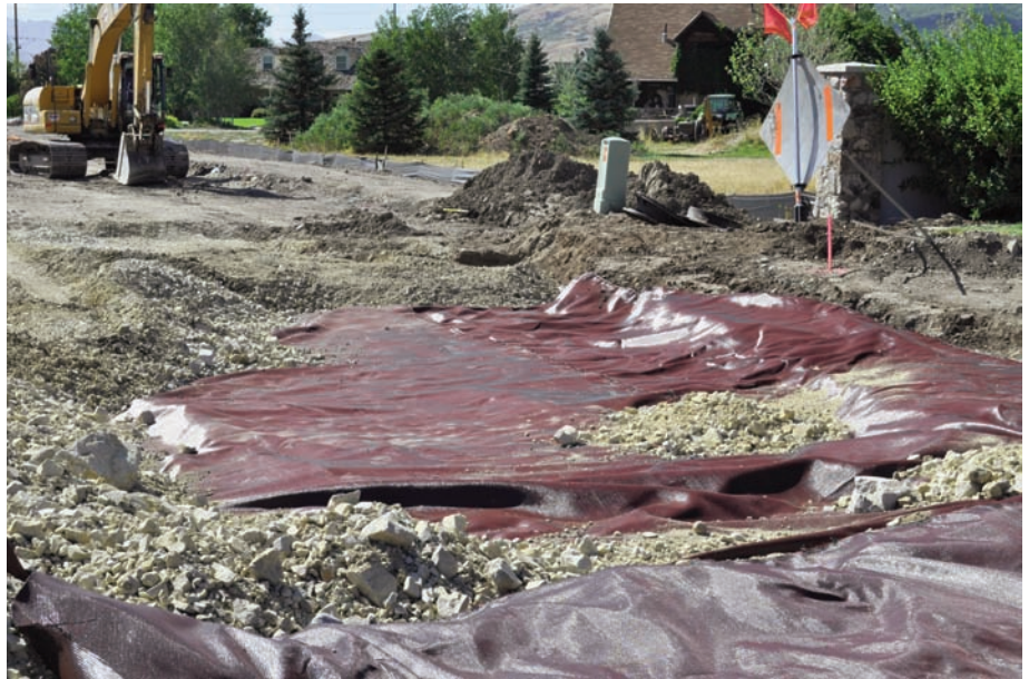
Installation of Mirafi® RS580i on soft soil area.

TenCate™ Geosynthetics North America assumes no liability for the accuracy or completeness of this information or for the ultimate use by the purchaser. TenCate™ Geosynthetics North America disclaims any and all express, implied, or statutory standards, warranties or guarantees, including without limitation any implied warranty as to merchantability or fitness for a particular purpose or arising from a course of dealing or usage of trade as to any equipment, materials, or information furnished herewith. This document should not be construed as engineering advice.