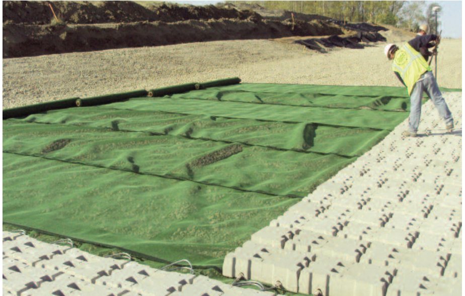
The overlap of the Miramesh® GR measured 12” and was shingled in the direction of the flow.

Another issue with the geogrid occurred when the ACBM systems are backfilled with topsoil and seed. The large open area of the geogrid (approximately 1” x 1”) could potentially contaminate the aggregate drainage medium if there was not a gradation or filter layer. MirameshGR effectively solves this problem by retaining the underlying aggregate during a catastrophic event, but also impedes the soil from migrating down through the system.