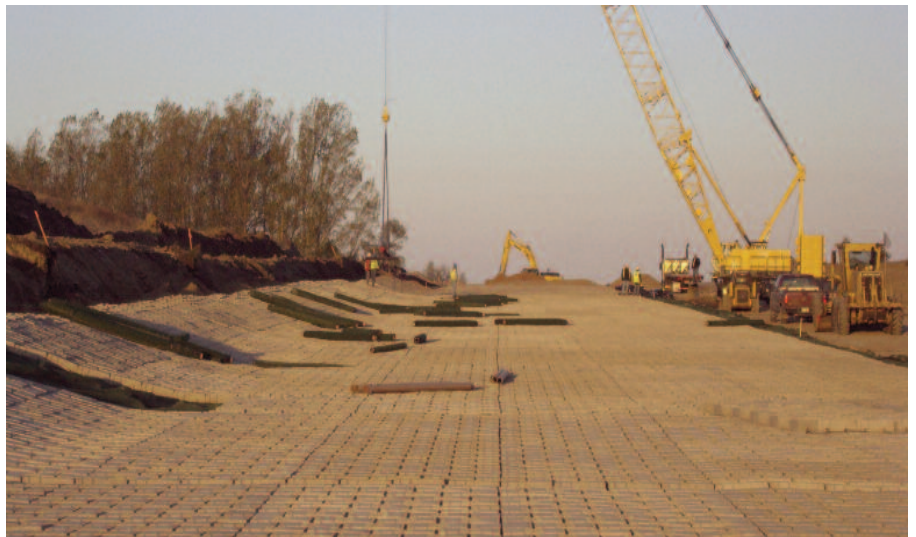
When completed the spillway will measure 148’ in width and over 1,020’ in length.

TenCate™ Geosynthetics North America assumes no liability for the accuracy or completeness of this information or for the ultimate use by the purchaser. TenCate™ Geosynthetics North America disclaims any and all express, implied, or statutory standards, warranties or guarantees, including without limitation any implied warranty as to merchantability or fitness for a particular purpose or arising from a course of dealing or usage of trade as to any equipment, materials, or information furnished herewith. This document should not be construed as engineering advice.