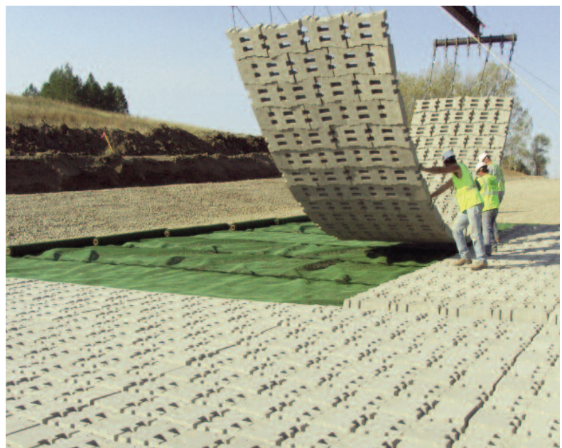
UltraFlex® articulating concrete mats being placed on Miramesh® GR.