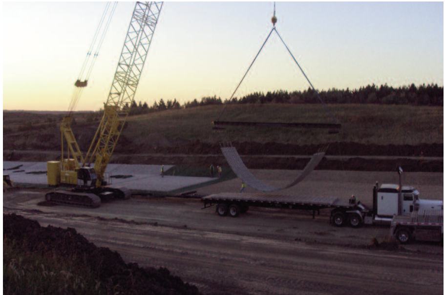
UltraFlex® articulating concrete block/mats by Submar, Inc. during installation.

Submar, Inc. began testing Miramesh® GR sandwiched between the tapered UltraFlex system and an aggregate drainage medium at Colorado State University in 2009. The results were very positive. Field installations began shortly there-