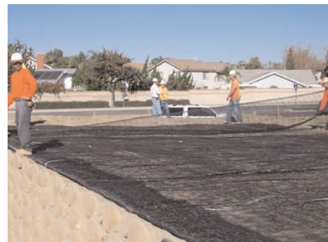
Placing the Miragrid® 24XT & 10XT.

In construction of the Verdura Wall, heavy earthmoving scrapers were used for wall backfill placement. The block facing in the lower portion of the wall is the Verdura 60 wall block.