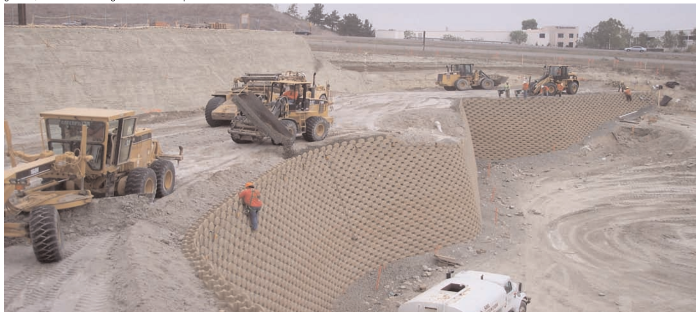
SRS Verdura Wall in construction

TenCate Geosynthetics North America assumes no liability for the accuracy or completeness of this information or for the ultimate use by the purchaser. TenCate Geosynthetics North America disclaims any and all express, implied, or statutory standards, warranties or guarantees, including without limitation any implied warranty as to merchantability or fitness for a particular purpose or arising from a course of dealing or usage of trade as to any equipment, materials, or information furnished herewith. This document should not be construed as engineering advice.