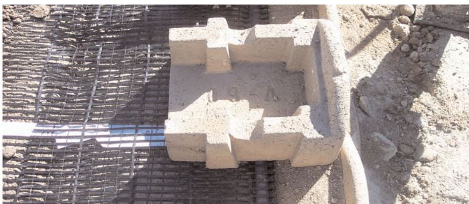
Miragrid® and Schedule 80 PVC pipe connection to Verdura 60 block.